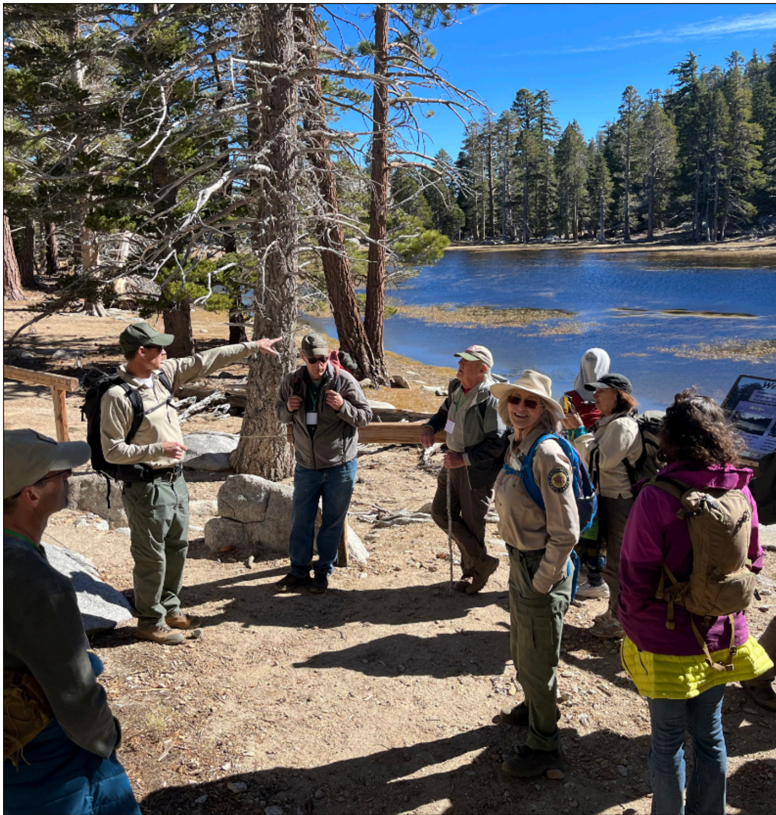
The CSPRA Rendezvous tours Hidden Lake, story on page 4