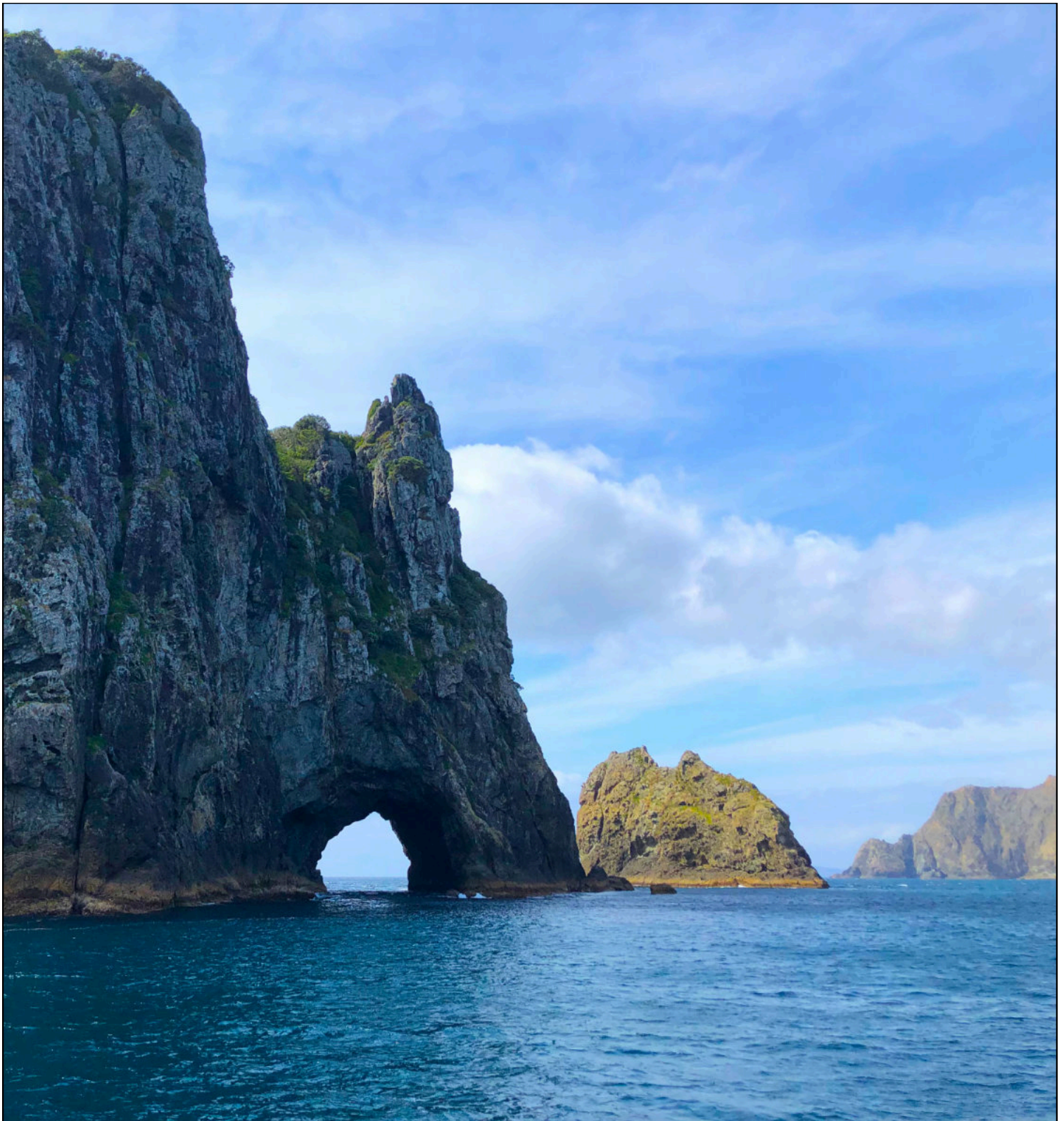
See page 6 for Oceania Ranger Forum. Hole in the Rock (Māori-language name Motu Kōkako), Bay of Islands, NZ